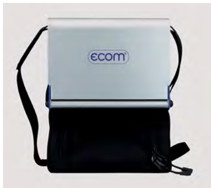
Shoulder carrying strap and bag (accessoires)