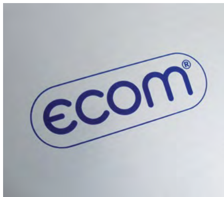
High-value aluminium housing